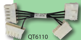
QT6110 QwikConnect ECM Adapter is useful for replacing ECM 2.3 or Eon Motors in fan coil units to Evergreen® CM or EM motors.