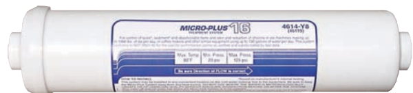
#4614-Y8 – (Length 14.125", Diameter 2.59")