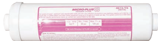
#4613-Y8 – (Length 11.375", Diameter 2.59")