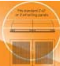
Two standard 2'x4' or 2'x6' ceiling panels