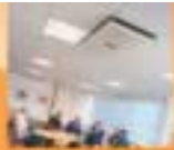
Recessed Ceiling Mount